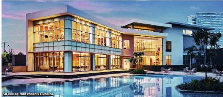
50,000-sq-foot Phoenix Club One

At One Bangalore West, every space has been crafted with elegance and sophistication. Designed by international award-winning architects, Phoenix One Bangalore West was conceptualised using state-of-the-art building management systems. The homes have been designed to ensure that residents get maximum fresh air and light, thus