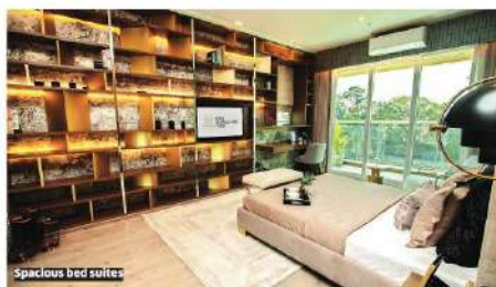
Spacious bed suites

To book an exclusive visit to the property, call - 91 95133 93910