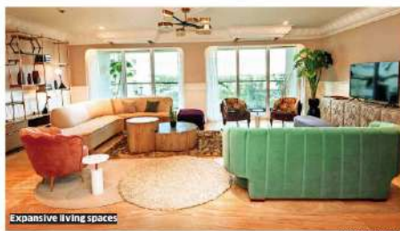
Expansive living spaces