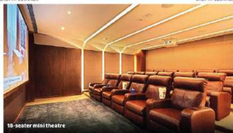
10-seater mini theatre