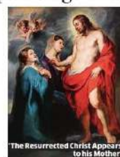
The Resurrected Christ Appears to his Mother

According to the Art Newspaper , the masterpiece has been returned to the exhibition. However, a probe